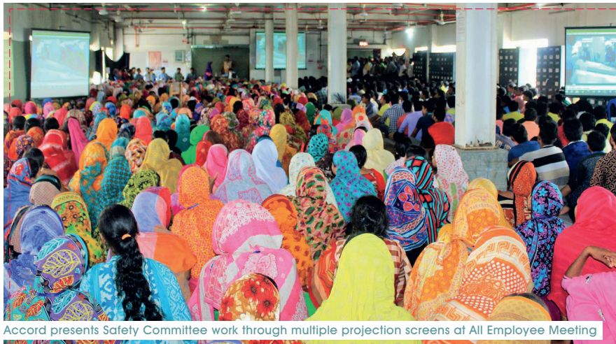
Accord presents Safety Committee work through multiple projection screens at All Employee Meeting